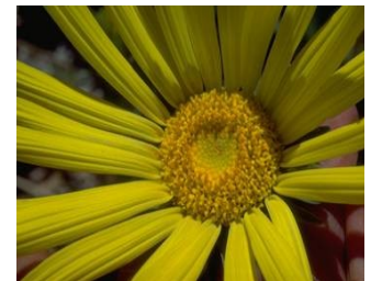
Art Washes Away From the Soul the Dust of Everyday Life - Pablo Picasso